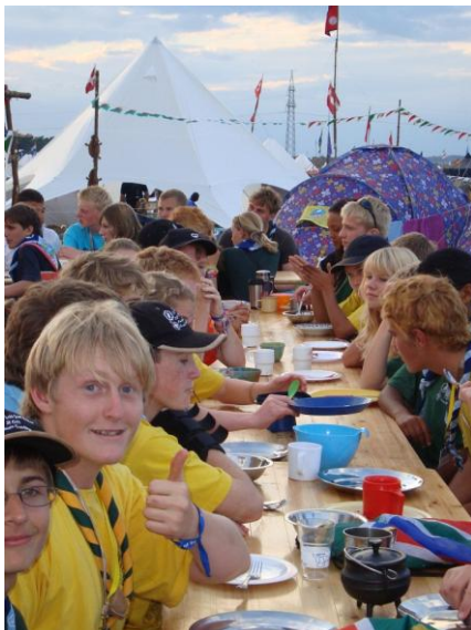
Dinner with Dutch scouts