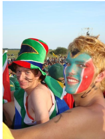
Proudly South African!!!