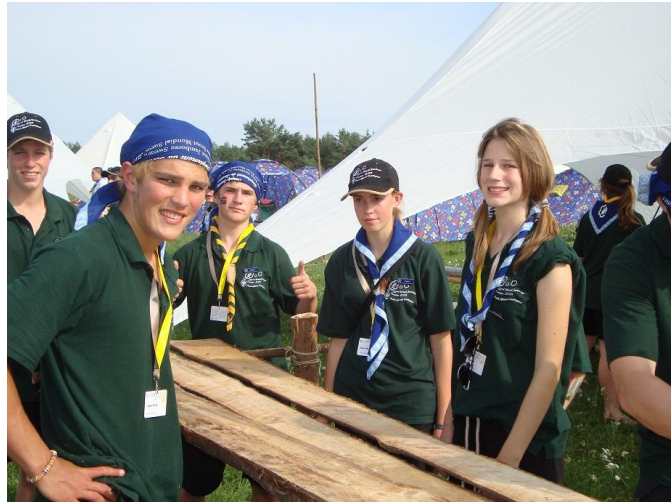
Setting up camp in southern Sweden

The Jamboree was preceded by a tour of Germany. Highlights of this tour included a cruise on the Rhine, exploring Marksberg Castle, climbing to the top of Colgne Cathedral, completing a tree-top obstacle course 20m off the ground in Schwindelfrei, visiting the Volkswagen factory in Wolfberg, exploring Berlin and attending a Medieval feast.