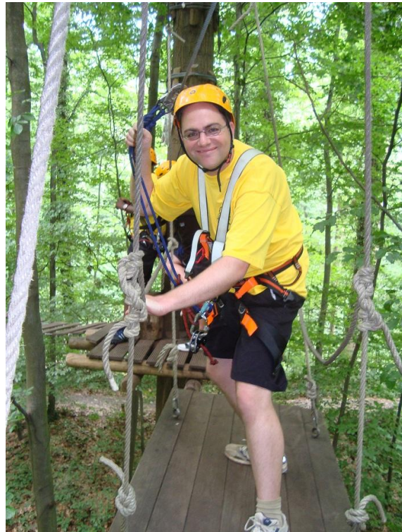
Aerial commando course at Schwindelfrei!

2 Last meeting of the year 3 White Stripe Dinner 9 – 13 Troop Holiday