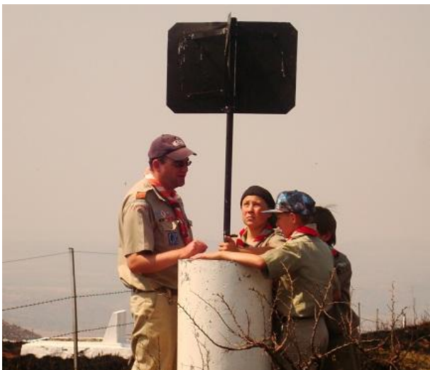
Learning about the Spioenkop trig-beacon