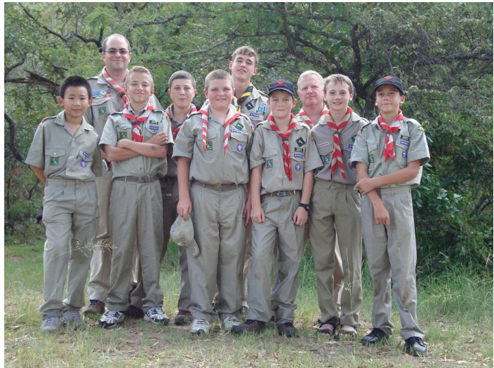
At the end of the Skeurkrans hike

If you have any queries please do not hesitate to contact me.