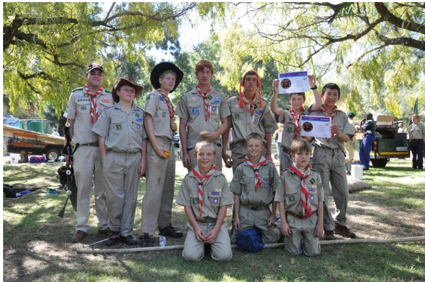
Members of the Kontiki team with their certificates

Firstly, the Troop did very well at the recent Kontiki Competition, walking away with a third place in the Beaver Challenge and a second place for the Supporter's Campsite. The theme for next year is "Kontiki goes Green" so start thinking about how we can put together an environmentally friendly raft!