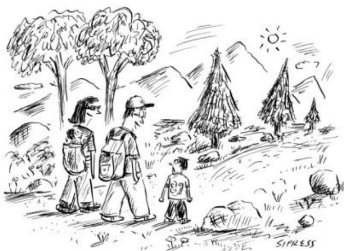
"What you hate is walking. This is hiking—biking is different from walking."

The registration process is fairly complicated so I will send out a separate email about