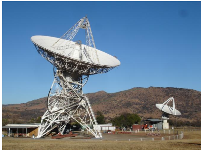
The Hartebeeshoek Radio Telescope

(Chorus) x2 We will do our best. We will do our best. And our best is better than any of the rest. While the others struggle and run round in a muddle We take a bow, the crowds will shout! HEY! The Boys from Bedfordview