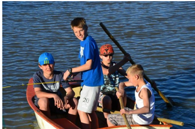
Fun on the Dads and Lads Camp in August