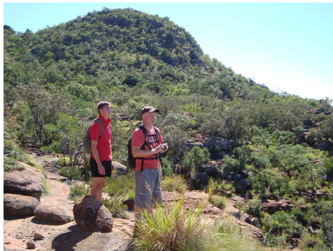
The rugged terrain at Skeurkrans

Ideally patrols should be planning and running camps and hikes without the direct supervision of scouters and I think that this hike, coupled with the planning on Friday, is going to go a long way to providing the patrols with the skills and training to accomplish this.