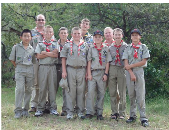
Attendees at the 2012 Skeurkrans Hike. Recognise anyone?

It has been brought to my attention that Hurleyvale Primary School is writing examinations around this time. Regrettably at this time of the year someone will always be writing exams and the calendar is too full to move the hike. Whether you allow your son to attend the hike is up to you, but I suggest that Hurleyvale Primary scouts chat to their parents ASAP and perhaps put in a full weekend's work this weekend to help convince your parents that you are ready for exams. The benefits of the hike should be obvious but there will be other hikes in the future.