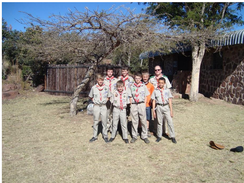
Attendees of the Stamvrug Hike

The country around Pongola is tough. Steep hills with plenty of cliffs are infested with thick bush and the exotic (and thorny) lantana. Valleys are deep so the sun only rises at about 08h15 and there is no cellphone signal. In addition to smaller game and an abundance of cattle, elephant from the neighbouring Ithala Nature Reserve occasionally cross the Pongola. To top things off a cold snap hit South Africa early on in the adventure. Ithala recorded temperatures of -5° on the Tuesday morning and the organiser, who has been attending survival bashes since 1987, noted that this was by far the coldest he had ever known Pongola.