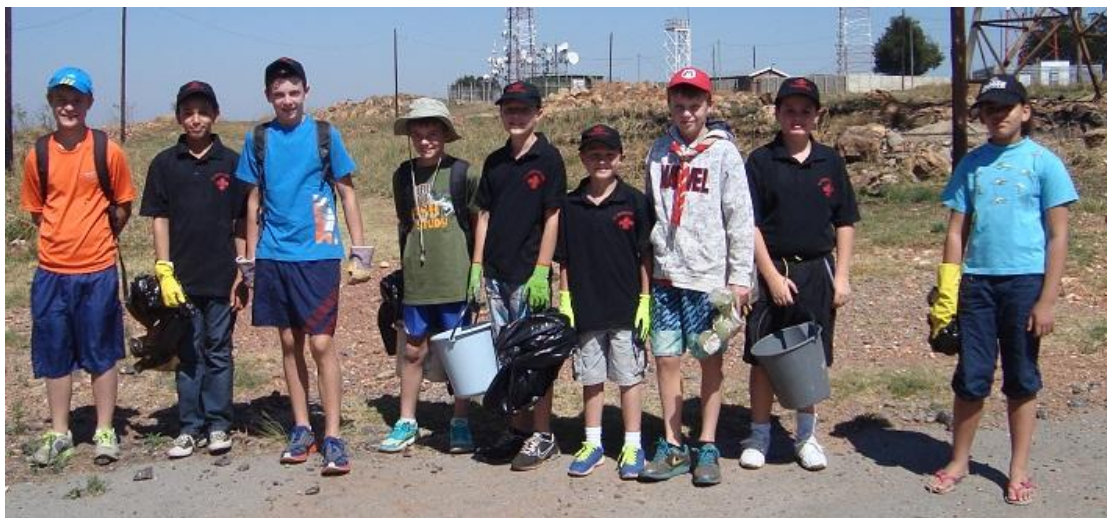
Members of the 1 st Bedfordview Scout Group and the 1 st Bedfordview Guide Company prepare to help clean up the Bill Stewart Nature Reserve.