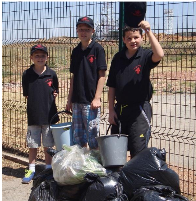
Look at what we collected mom!

The troop runs an inter-patrol competition from 1 October to 30 September each year. These points determine who wins the patrol of the year competition. From now on a running total of points earned thus far will be set out in each newsletter to help patrols see where they stand in the race to lift the trophy. As of today, points stand as follows for the 2014 / 2015 year: