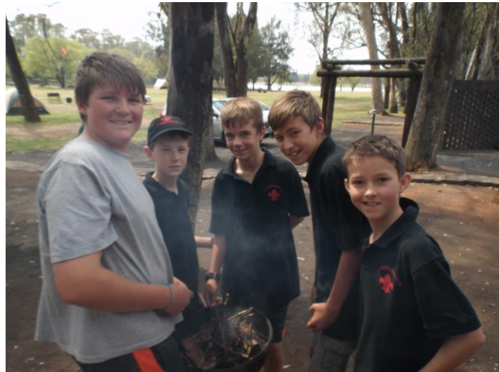
At the District Competition Camp

The Group AGM was a success with a new and vibrant committee in place. Congratulations must be extended to all the scouts who were awarded prizes at the evening and to Springbok Patrol who won the inter-patrol competition for 2014 / 2015.