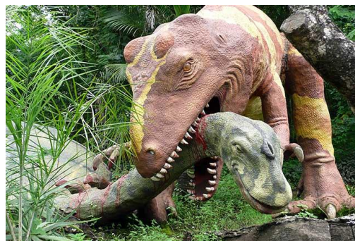
The Sudwala Dinosaur Park