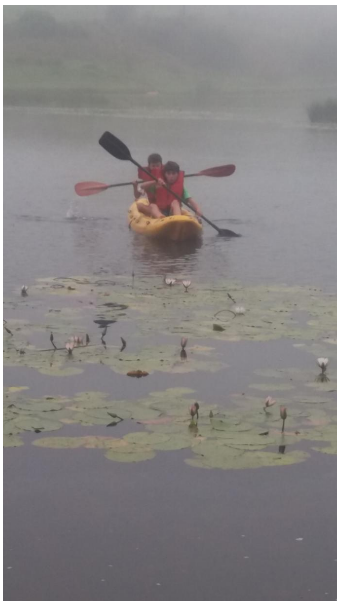
Canoeists in the Mist – Year End Camp

in Sunday 28 February 2016, when we will be joining the Eastleigh Sea Scouts at Arrowe Park in Benoni where you can be tested on the badge.