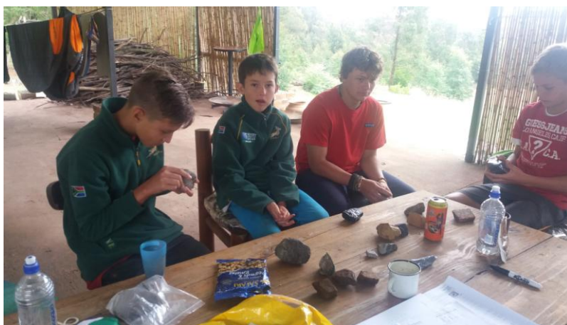
Learning a bit about geology – Year End Camp