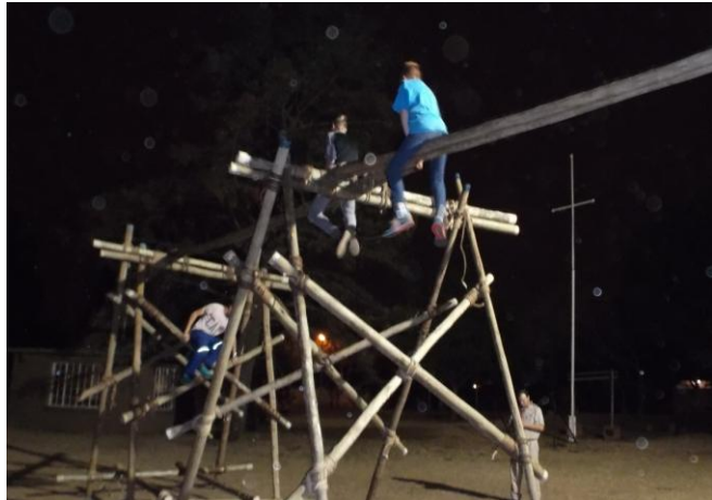
Pioneering at a recent troop programme

At present we have 25 people attending the Dads and Lads, which promises to be a fantastic weekend away from the hustle and bustle of Johannesburg. At present we are awaiting final details from the booking agent, after which detailed information on the hike will be sent out.