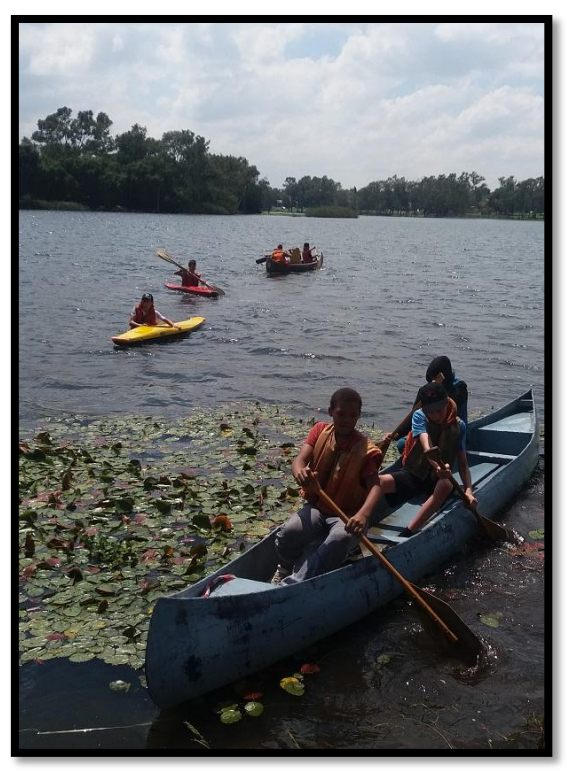
Boating on the recent Pioneering Camp

If you would like more information on Kontiki please visit <u>http://kontiki.scouts.co.za/</u>. A newsletter with final information such as meeting times, a kit list, how to get to Arrowe Park and final costings will be sent out once we have final numbers.