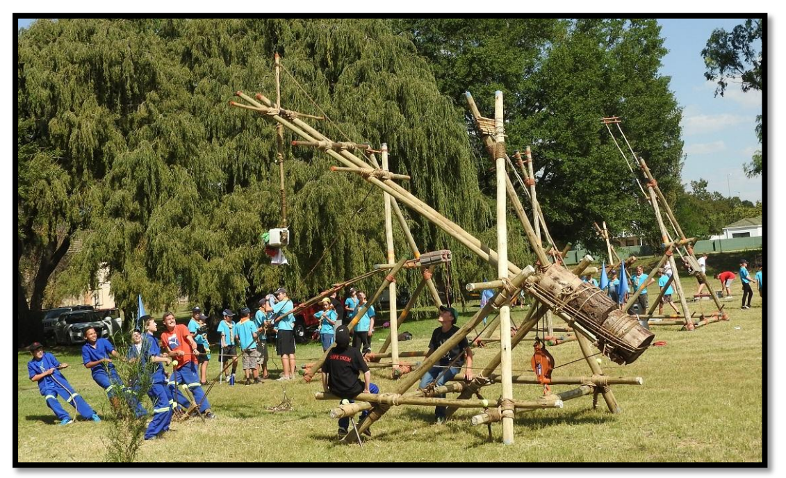
Preparing to fire – Catapults at the Northrand District Pioneering Competition

In order to complete our final planning it is important that we know exactly who will be at Kontiki. Once we know this information we will be able to give an accurate cost for the event, which is estimated to be R280 for the weekend. This includes all food, an event badge and camping fees for the weekend.