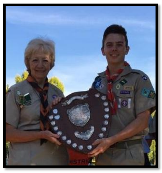
The LA Shield – Group of the Year

Did you know that there is a badge for recruiting friends into scouts? It is called the recruiters badge and you get a silver badge (one to four friends) and a gold badge (five friends or more) if your friends become fully invested scouts.