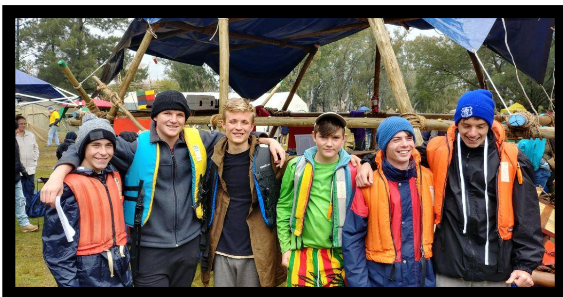
A very wet and cold raft team in good spirits – Kontiki 2017

After an absence of 16 years Scouts South Africa will once again be running a SANJAMB (South African National Jamboree). A Jamboree is a gathering of scouts and guides where you get to learn about new cultures, make new friendships and take part in an exciting programme of activities. Though most of the attendees will be