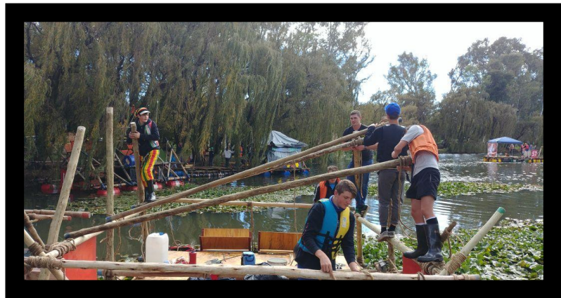
Deconstructing the Kontiki Raft

One of the biggest challenges in obtaining a “gold” award is attendance, patrols have to average 75% attendance over the year. As such I would make an appeal to all scouts to ensure that you have at least 75% attendance so your patrol can achieve. An updated attendance register can be found on the notice board.