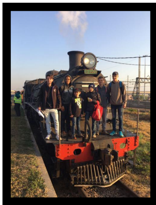
Sable on their recent Expedition

We will be covering a 10km night hike – long enough to qualify candidates for their Pathfinder log, so this is a good advancement opportunity but will also be a great deal of fun. The hike is a great way to enjoy the great outdoors on our very doorstep.