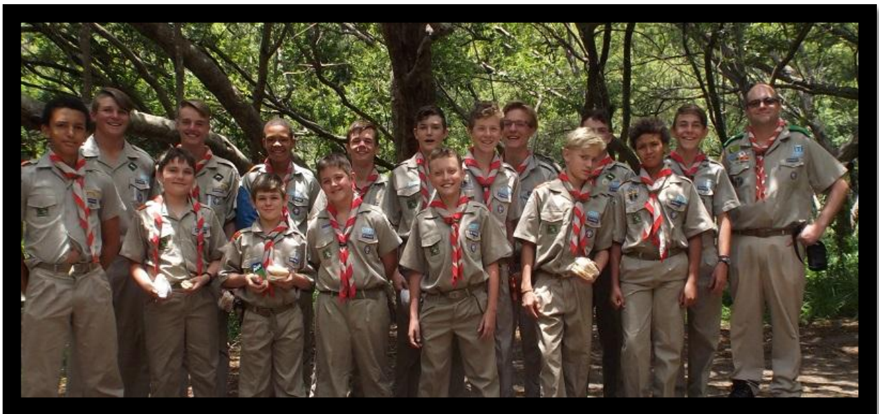
All good things come to an end – Year-end Camp 2017 in Maretlwane

In respect of the Injasuti Hike I am / am not interested in attending (delete as applicable)