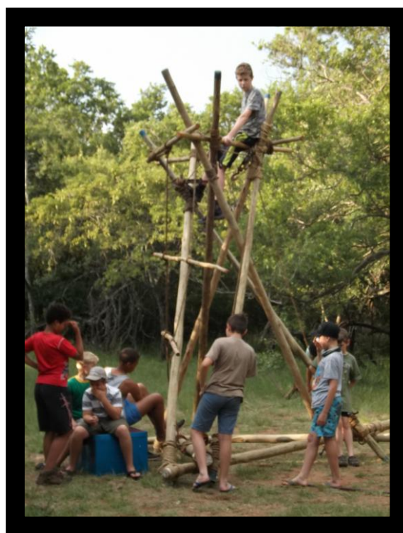
Pioneering at Maretlwane – Year-end camp

For photos of the area visit https://www.facebook.com/1sthoneydewscouts/