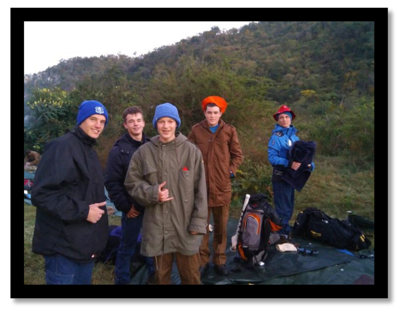
Striking camp at the Survival Bash

Remember that each patrol should be striving for a 75% aggregate attendance over the year. Are you doing your bit? Why not check out the attendance register on the notice board to see your personal attendance?