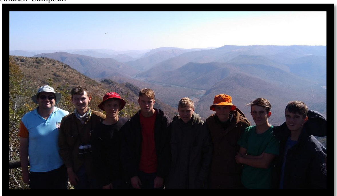
Overlooking the Pongola River from the Ithala Game Reserve.