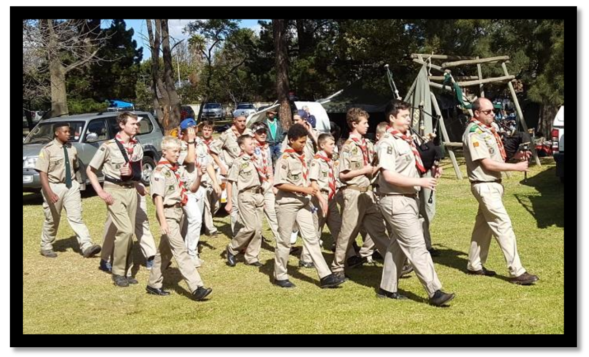
Marching to closing parade at Kontiki 2018

Seven scouts also attended the gruelling Survival Bash on the banks of the crocodile infested Pongola River. The scouts hiked over back-breaking terrain to their campsite, where they took part in a variety of activities including paintball, marksmanship, stalking, veldcraft, mapping, first aid, making pizza and a game drive in the Ithala Game Reserve.