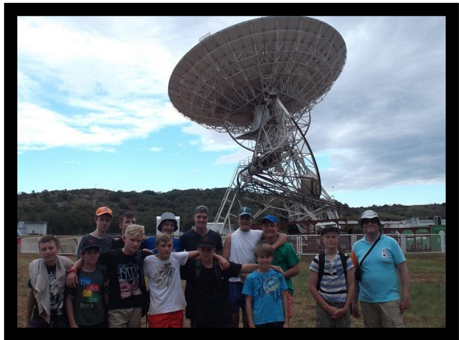
Hartebeeshoek Radio Telescope – Year End Camp

This camp is very important for those who want to attend Kontiki and especially those