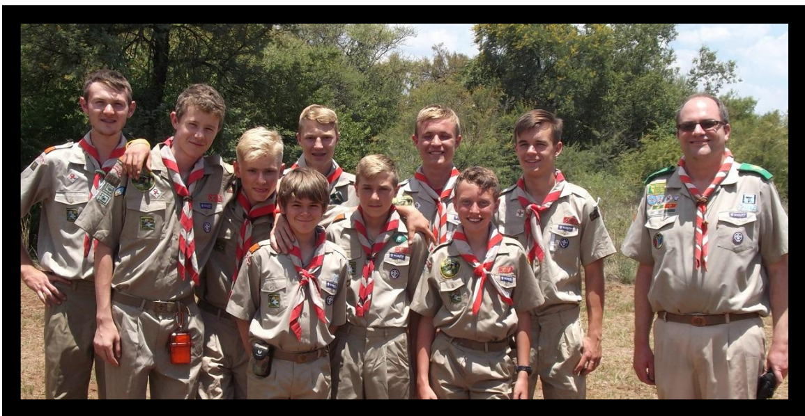
Some of the Attendees at the Year End Camp held at Gil-Ifafi

1 st Bedfordview Scout Group Standard Bank Eastgate Branch No: 018505 Account No: 022646221 Reference: First Aid Course + your surname Proof of Payment to: 1stbedfordscouts@gmail.com