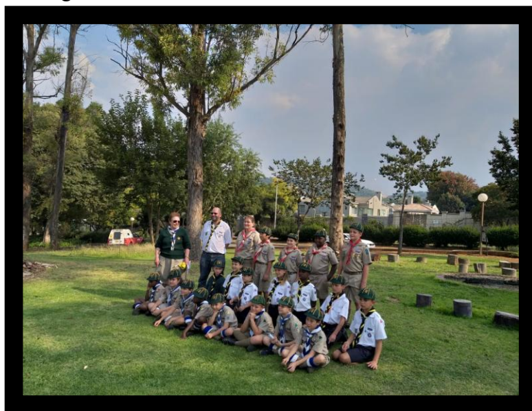
Attendees at the recent Pirate Camp

The cost of the evening is R150,00 per person which includes a light dinner. Please rsvp to kleerm@stbenedicts.co.za by no later than the 17 June 2019. If you are able to assist with the donation of any prizes please also let Michelle know.