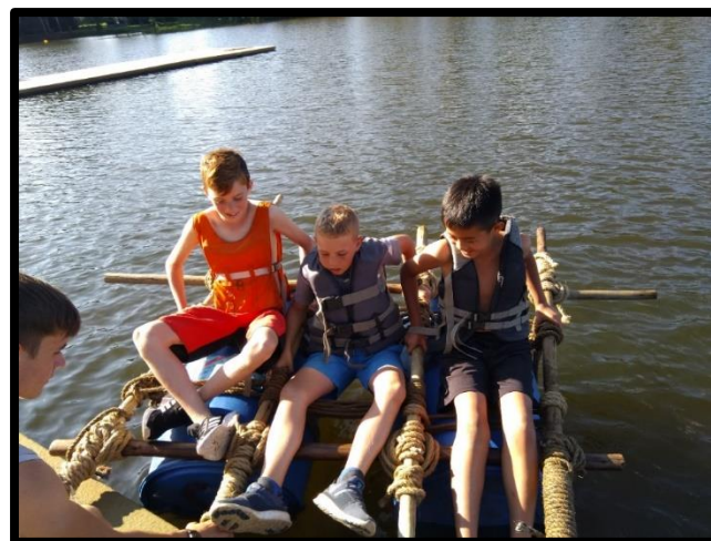
Prepare to set sail! Link Camp '20