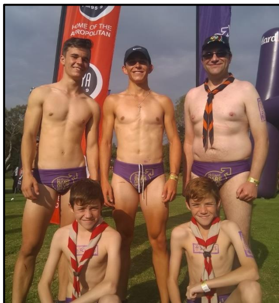
Hollard Daredevil Run 2020

During this difficult time I would like to remind all members that 1 st Bedfordview has a policy that, insofar as is possible, no-one should be denied the benefits of scouting due to financial circumstances.