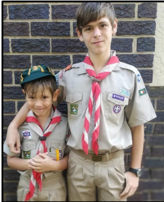
BP Day at Founder's Hill – Aragorn and Anakin